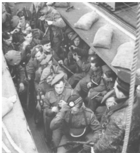
C Coy. 2 PARA returning from the successful Bruneval Raid