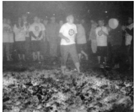
Warming up -on hot coals!