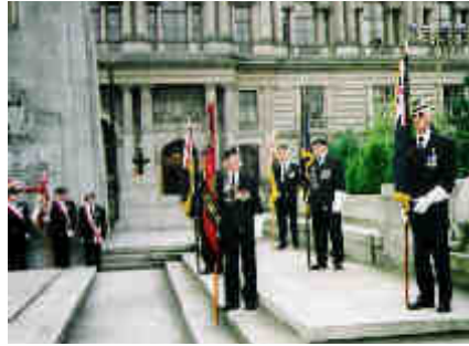
At the Cenotaph

Polish citizens on both sides of the new divide were to suffer badly from loss of liberty, persecution and death. Fifteen hundred Polish officers who had been taken